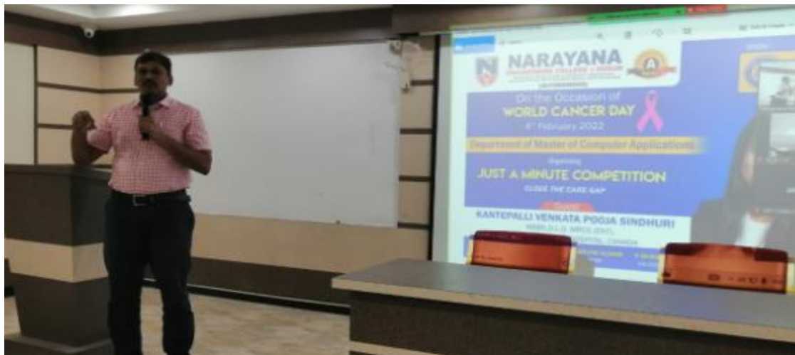
Principal Sir address the students on the occasion of Cancer Day