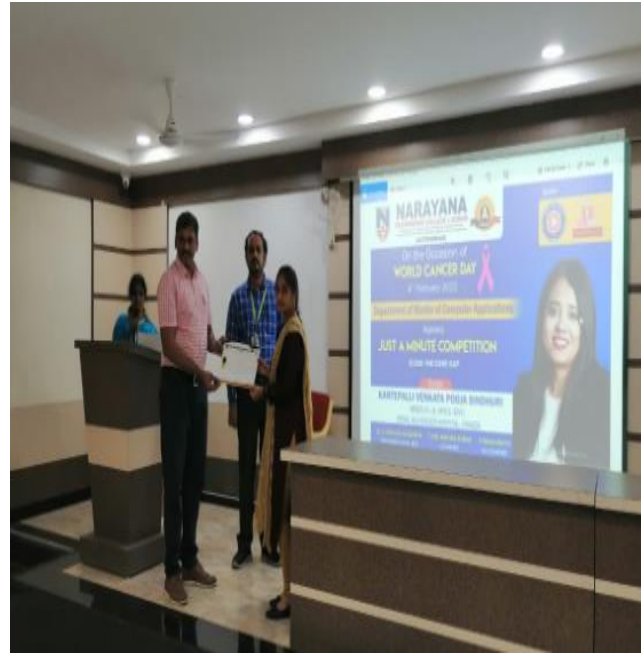
Distribution of Prizes to the Winners by Our beloved Principal